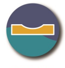
CURB CUT APPLICATION