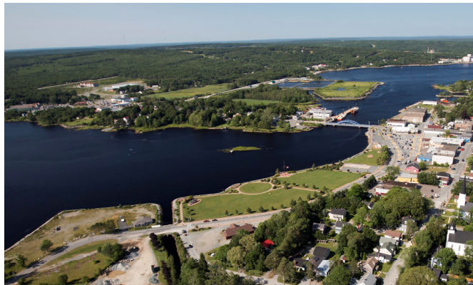
The Mersey River flows into the Atlantic Ocean at Liverpool Bay. Pictured is Liverpool's waterfront. Recent years have seen increased flooding in this area at times of storm surge.

The most common and frequent areas of Liverpool to flood are the waterfront parks and parking lot, which were built on reclaimed land that was once part of the river. Climate change and increases