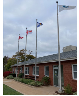
Updated Policy 84 outlines which flags are flown at Municipally owned sites.

Flags are symbols reflecting the heritage, culture and values of a government, corporate body or community. Region of Queens Municipality proudly flies flags at various municipal locations. At the October 12, 2021 Regular Council meeting, Council approved an amended Flags Policy. The updated policy provides clear protocols for flying flags on municipal properties, along with direction for when flags are to be flown at half mast, and requests for flags to fly on the Special Purpose flag pole, which is now located at the Town Hall Arts and Cultural Centre. Additions were made to the list of flags that fly each year on the Special Purpose flag pole, to be more inclusive of the diverse population in Queens County. There were also more dates of recognition added on which the municipality will fly flags at half mast each year. Policy 84: Flags is available online: https://www.regionofqueens.com/document-library/operational-policies/1279-policy-84-flag-flying-policy